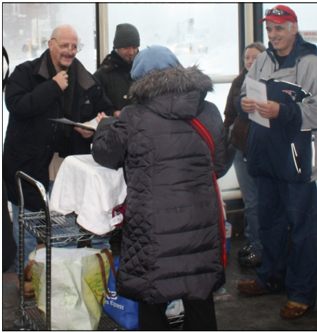
In the coldest days of winter, our Porter Square congregation meets just inside the MBTA station.